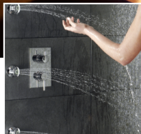
Multiple shower units including pressure jets